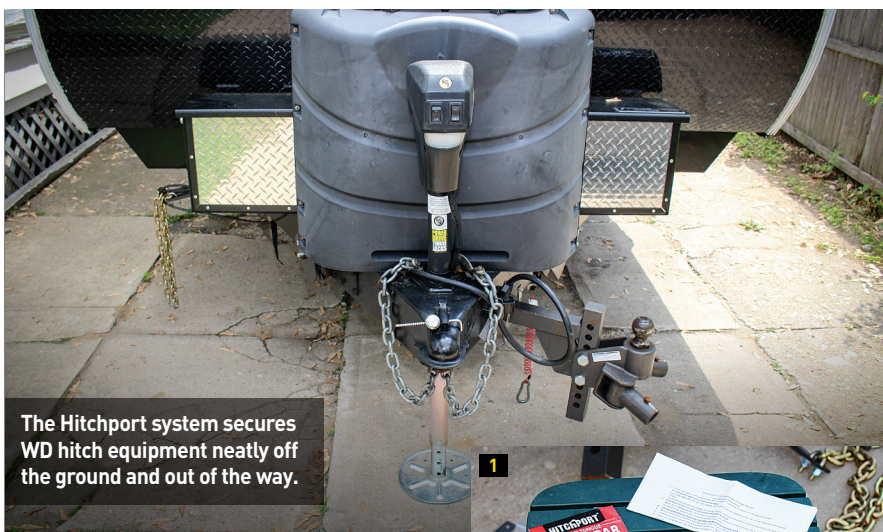
The Hitchport system secures WD hitch equipment neatly off the ground and out of the way.

The Hitchport system is made up of two primary products, the Hitch Bar Storage Mount (MSRP: $14.99), designed for up to 2-inch ball mounts, and